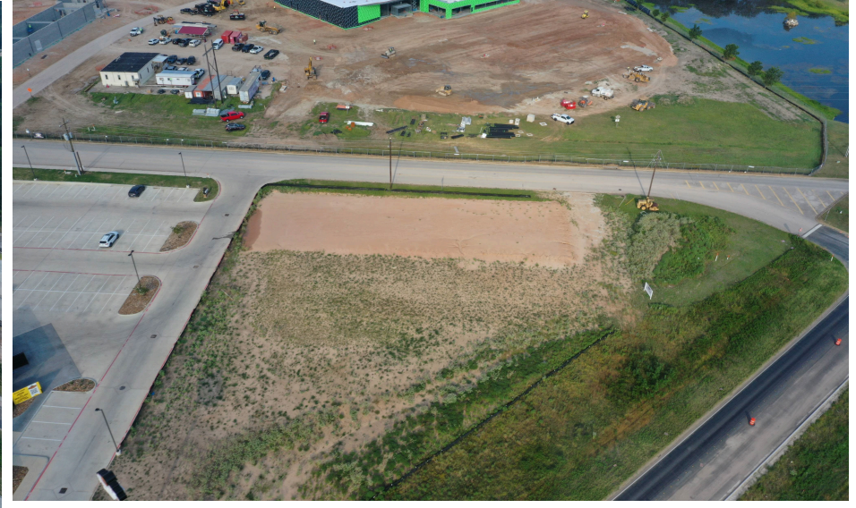
Facing West Along Veterans Memorial