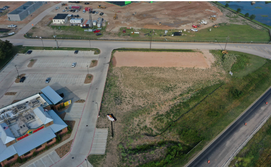
Facing North Along I-45