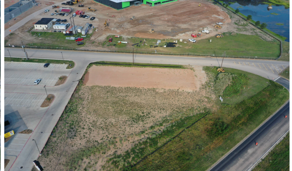
Facing West Along Veterans Memorial