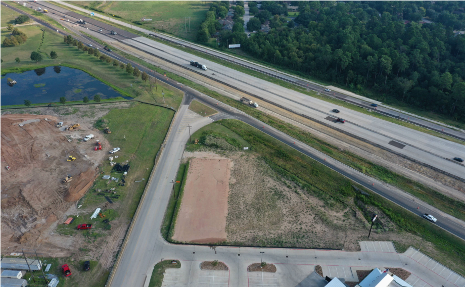
Facing East Towards I-45